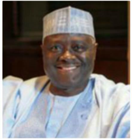
Gen. Martin Luther Agwai Chairman

Gen. Martin Luther Agwai is a Commander of the Order of the Federal Republic (CFR). He attended Government Secondary School (now Alhudahuda College), Zaria and holds a Post Graduate Diploma Administration with distinction from the Administrative Staff College of Nigeria (ASCON) as well as a Master of Science Degree in National Resource Strategy from the National Defense University (NDU) in Washington DC, USA. He enlisted into the Nigerian Armed Forces as a member of Regular Combatant Course 8 in 1970 and was commissioned in 1972. He rose swiftly through the ranks to the position of Chief of Army Staff in June 2003.