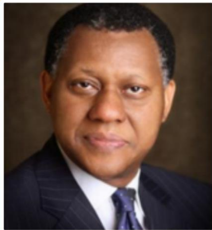
Mr. Odein Alumogobia Director

Mr. Odein Ajumogobia is a Senior Advocate of Nigeria (SAN), a Fellow of the Chartered Institute of Arbitrators FCI, Arb (London) and he is a leading environment and pollution litigator. He is also a former member of ICC, International Court of Arbitration in Paris. He attended University of Lagos with an LLB Honors and the Harvard Law School Massachusetts (LL.M). He served with the Nigerian Liquefied and Natural Gas (NLNG) as a Consultant and is a Partner, Ajumogobia and Okeke, a leading Commercial Law firm.